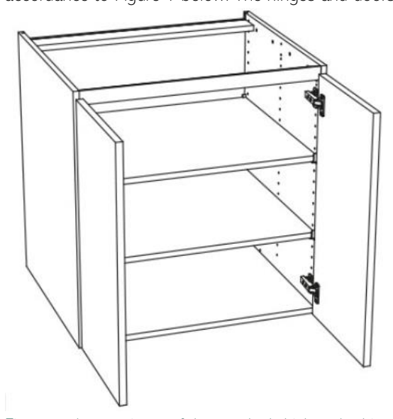
Figure 1, show a picture of the standard chipboard cabinet with melamine

A cabinet is the structure in which the doors and drawers are installed. The core of the cabinet is made of chipboard and the surface is laminated or with glued veneer. The standard cabinet has two sides, two shelves and a top in accordance to Figure 1 below. The hinges and doors are not part of the cabinet.