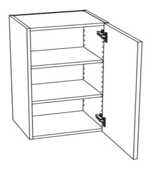
Figure 1, shows a picture of the plain and painted MDF kitchen door Harmoni White and its application in a kitchen cabinet.